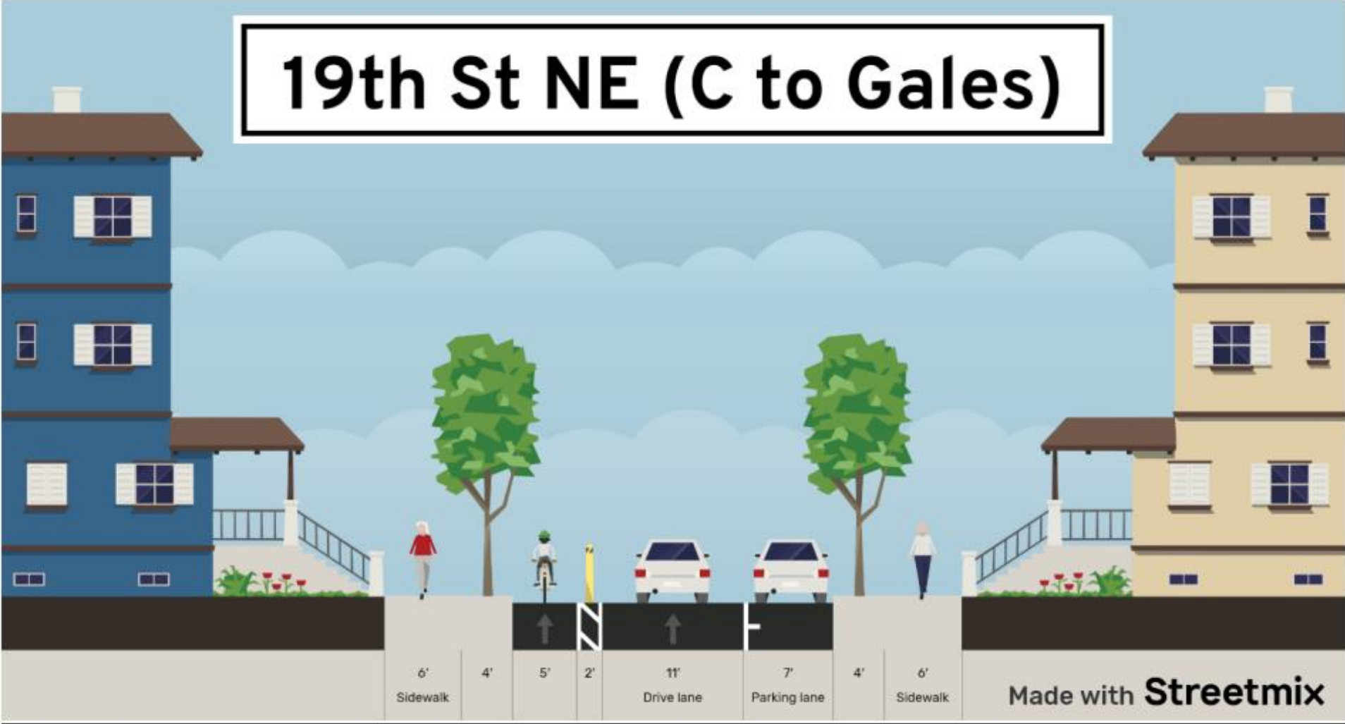
Figure 1 The protected bike lane will run on the left side to maintain a direct path from the existing facility on 19 th St NE