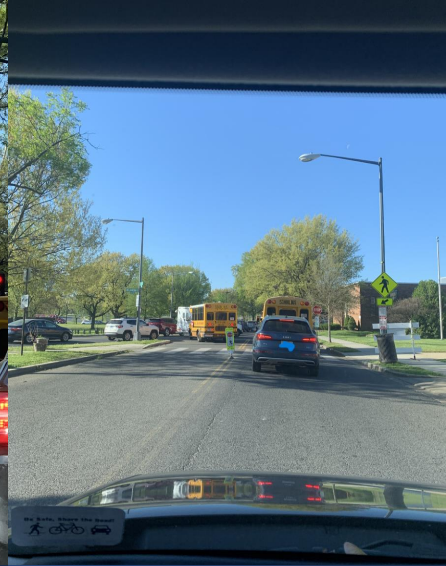
TSI 23-00228592 : 21st and D street Seeking study of morning rush hour congestion